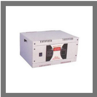
Automatic Voltage Stabilizer with Digital Display