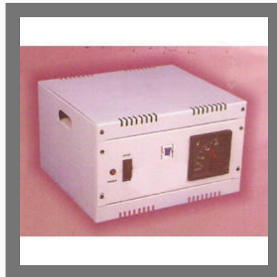
Automatic Step Up Voltage Stabilizer