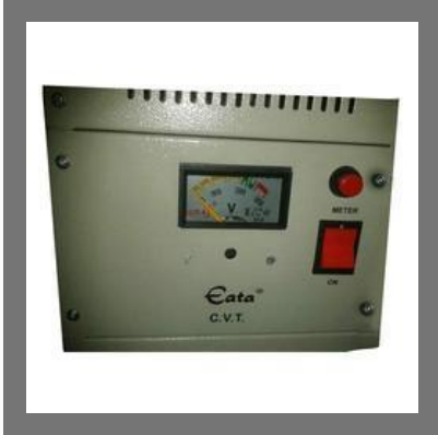
Constant Voltage Transformer