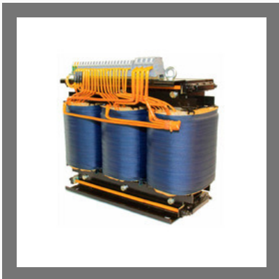
Three Phase Transformer