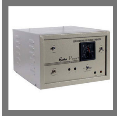
Servo Controlled Voltage Stabilizer