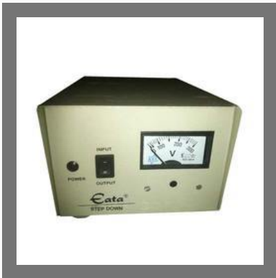
Step Down Voltage Converter