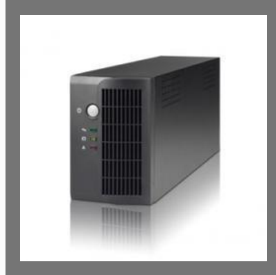
LCD Home UPS