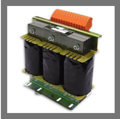
Single Phase Transformer