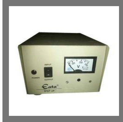
Step Up Voltage Converter